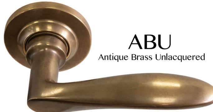
ABU Antique Brass Unlacquered