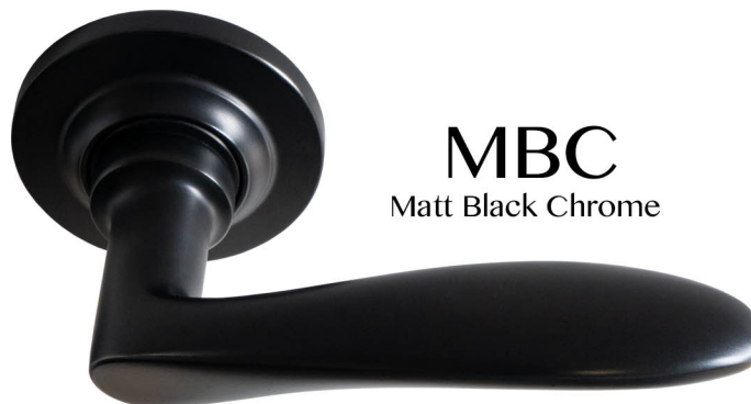
MBC Matt Black Chrome