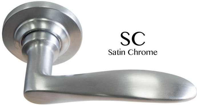
SC Satin Chrome