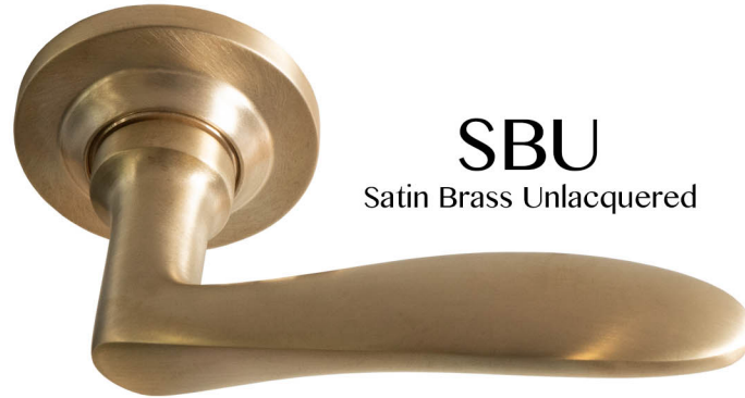
SBU Satin Brass Unlacquered