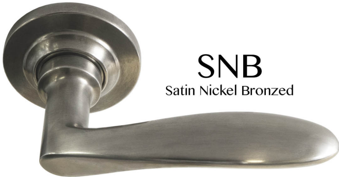
SNB Satin Nickel Bronzed