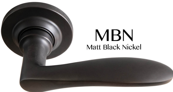
MBN Matt Black Nickel