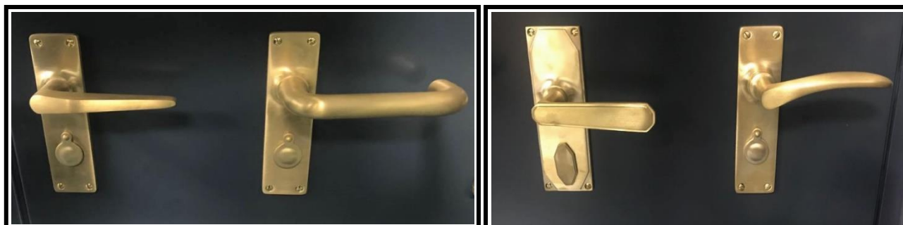
55 Series 5512

Please note, all internal doors come without a lock unless this is requested.